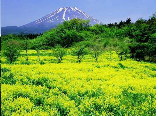
Spring & Summer